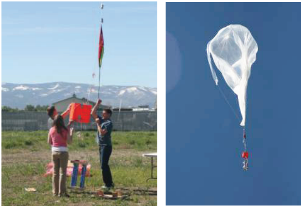
Left: Launching the dropsonde system; the balloon is lifting the parachute at this time. Right: The dropsonde launcher system in flight under a zero-pressure balloon, viewed shortly after launch.

The balloon-borne payload releases dropsondes based on Anasphere's AnaSonde-2G radiosondes, which return pressure, temperature, relative humidity, and wind speed and direction data. Data from the dropsondes is received by the launcher payload and relayed via satellite to a remote server. Commands, including dropsonde release and balloon release, are sent via satellite to the payload.