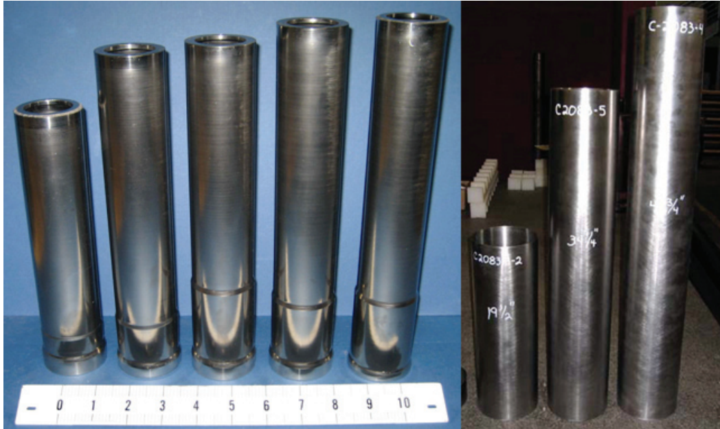
Nano-enhanced titanium alloy tactical rocket motor cases

This Air Force SBIR/STTR Innovation Story is an example of Air Force supported SBIR/STTR technology that met topic requirements and has outstanding potential for Air Force and DoD.