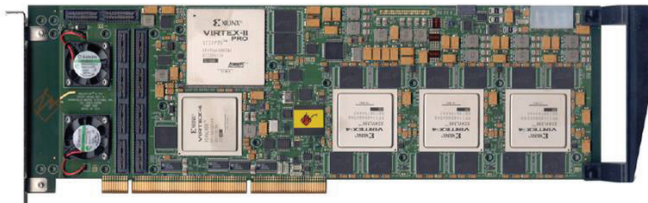
Annapolis Micro Wildstar FPGA card

NAVSYS successfully demonstrated a wideband derivative-based updating (DBU) adaptive beamforming (ABF) algorithm implemented on field-programmable gate array (FPGA) hardware that matches robust simulated results that can be adapted to suit various radar configurations and timings. With this hardware, wideband radars can perform adaptive beamforming interference mitigation in real-time. This eliminates the need and latency associated with implementing the adaptive beamforming via post-processing software.